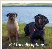
Pet friendly options

In the Central Maine Lakes Region , at the crossroads to all the beauty of Maine, enjoy nearby hiking, biking, golfing, and fishing sites or gaming at the Oxford Casino. Take a day trip to the Western Maine Mountains, the gorgeous Maine coast, the fine dining of Portland or outlet shopping in Freeport, Kittery and North Conway, NH.